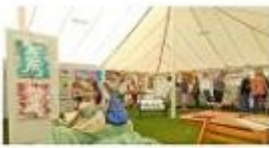
Mudeford Arts Festival 2023